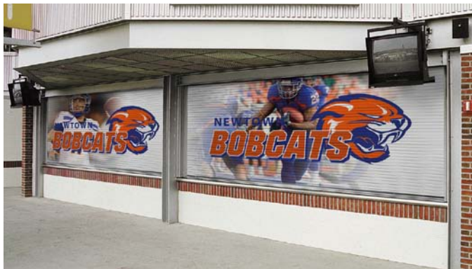
Model CESC10 Door with Graphics