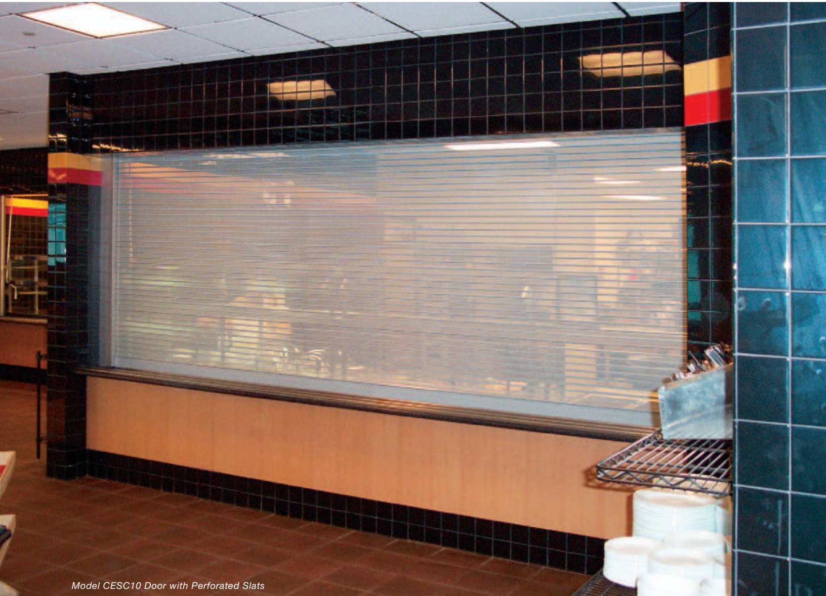
Model CESC10 Door with Perforated Slats