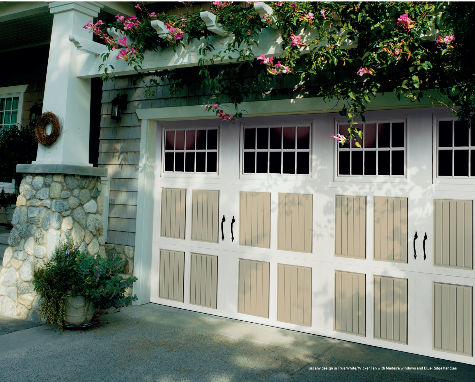
Tuscany design in True White/Wicker Tan with Madeira windows and Blue Ridge handles