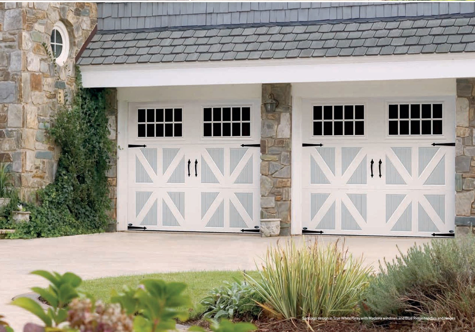
Santiago design in True White/Gray with Madeira windows and Blue Ridge handles and hinges