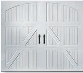
CLOSED ARCH (L1)