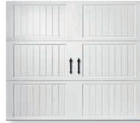
CLOSED SQUARE (C2)