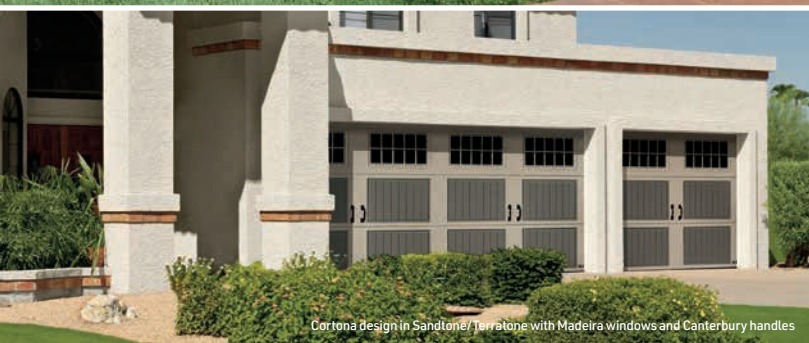
Cortona design in Sandtone/Terratone with Madeira windows and Canterbury handles