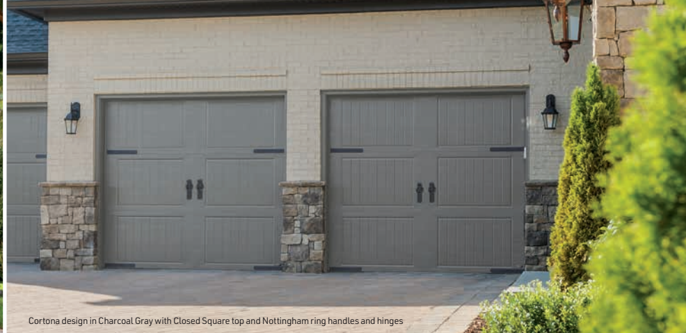
Cortona design in Charcoal Gray with Closed Square top and Nottingham ring handles and hinges