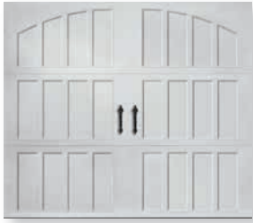
CLOSED ARCH (N1)