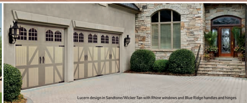
Lucern design in Sandtone/Wicker Tan with Rhine windows and Blue Ridge handles and hinges