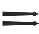
16" STRAP HINGES