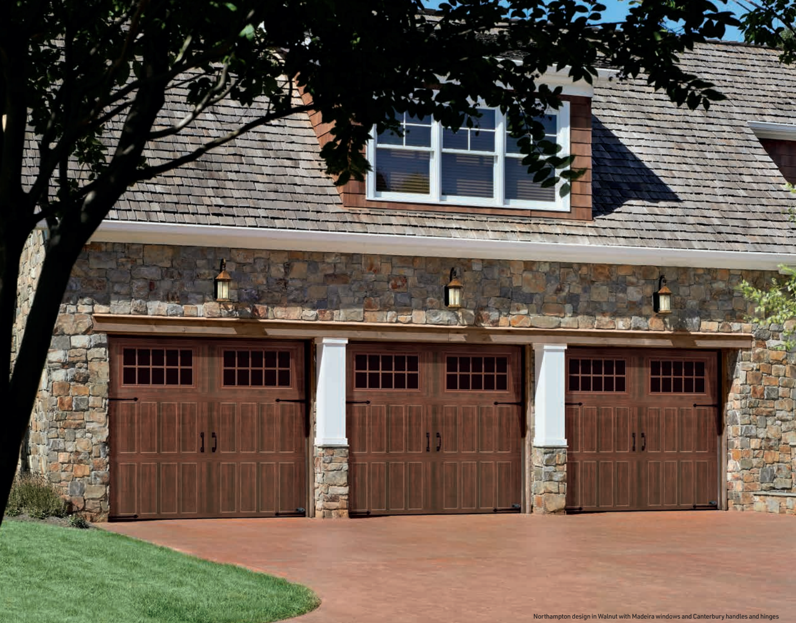
Northampton design in Walnut with Madeira windows and Canterbury handles and hinges