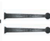
18" STRAP HINGES