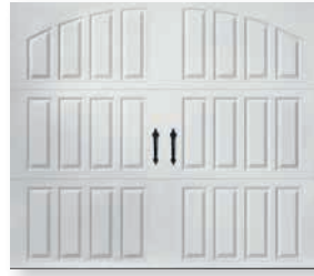
CLOSED ARCH (B1)