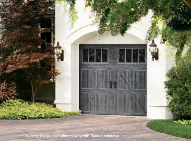
Lucern design in Weathered Gray with Thames windows