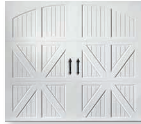
CLOSED ARCH (S1)