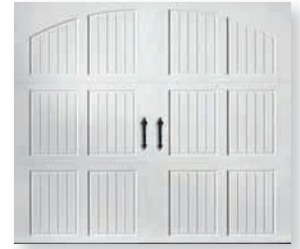
CLOSED ARCH (T1)