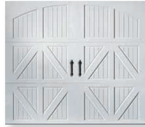
CLOSED ARCH (V1)